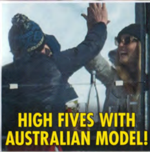
HIGH FIVES WITH AUSTRALIAN MODEL!